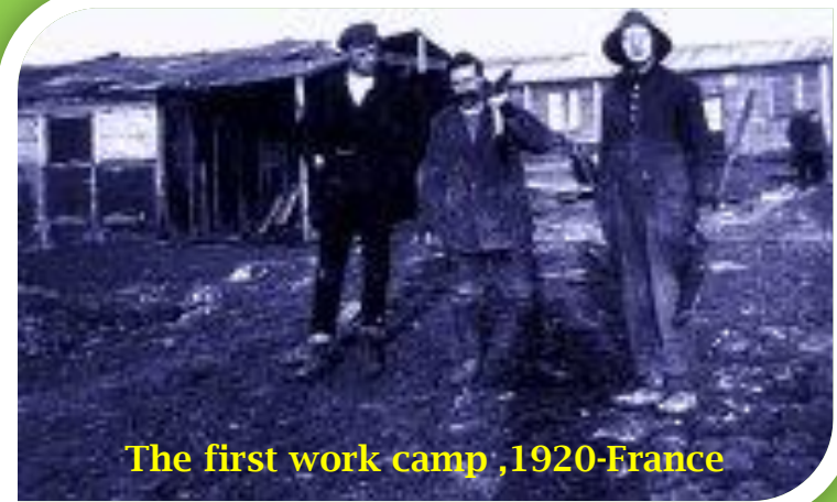
The first work camp ,1920-France